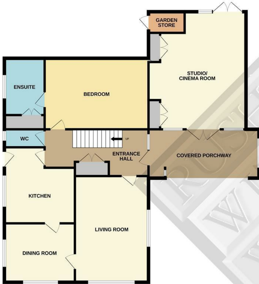
GROUND FLOOR 1403 sq.ft. (130.3 sq.m.) approx.